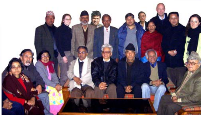
Members of Friends for Peace (FFP) and International Alert (IA) participating at the Strategic Planning Meeting, February 2007.

Friends for Peace (FFP) is a non-governmental, non-profit organization registered under the Associations Registration Act, 1977. It is dedicated to conflict transformation and peacebuilding in Nepal. FFP was established in May 2004 with a view to facilitate research in the sphere of conflict transformation and peacebuilding. When the second round of peace negotiations failed in 2003, a group of human rights activists and facilitators who were involved in the past two rounds of peace negotiations came up with the initiative regarding the need for a resource centre, which could provide needs-based and research-oriented knowledge and expertise to all stakeholders engaged in conflict resolution and peacebuilding endeavors. This concerted effort led to the birth of FFP. The current activities of FFP are implemented on the basis of Strategic Planning Meeting, under the guidance of the Executive Board, Board of Advisors and FFP staff in collaboration with International Alert, a London-based international peacebuilding NGO. With the mutating conflict dynamics, FFP remains a public resource, and keeps exploring new avenues related to conflict transformation and peacebuilding in Nepal. FFP continues to collaborate with different like-minded national and international organizations.